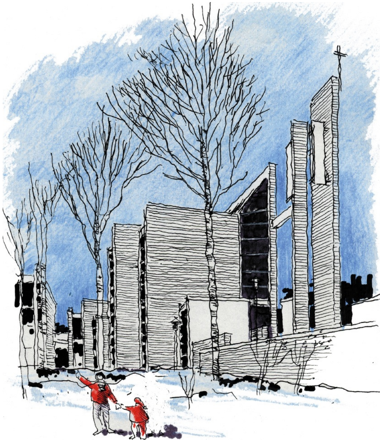
Myyrmäki Church and parish center, by Juha Leiviskä.