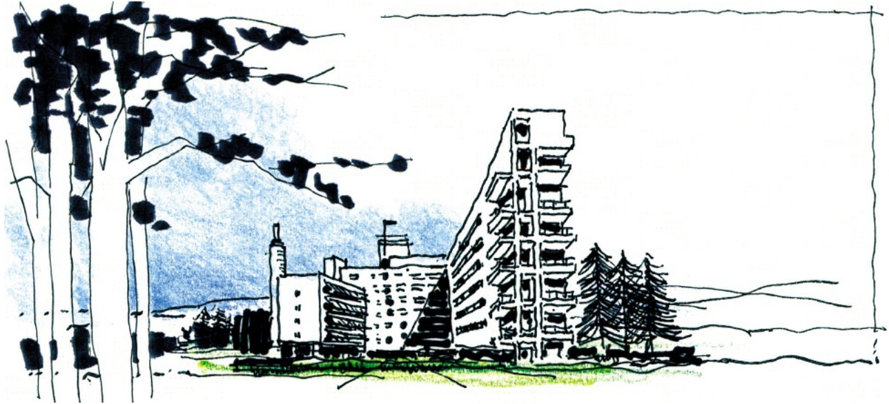
Paimio Sanatorium, in Paimio, Finland, designed by Alvar Aalto.

"Father-and-son architects Eliel and Eero Saarinen, of course, had roots in Finland. While at MIT I also had the good fortune to teach with another son of Finland, Alvar Aalto. Aalto had been invited to design Baker Hall, a new student dormitory. Normal methods were not Aalto's way of teaching: rather, he rounded up any and all willing students and herded them off to a coffeehouse or bar for a cup of joe or round of vodka. He could go on for hours, spinning stories – every one of them meaningful.